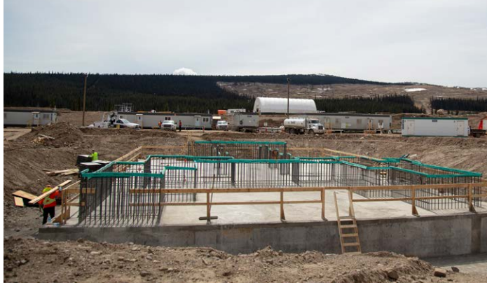
Ball Mill Foundation With Rebar - May 2023

Manufacturing of the process buildings is well advanced. Sedgman, our Engineering, Procurement and Construction (EPC) contractor, has mobilized to site, and the concrete batch plant has been commissioned. Concrete has been poured for the ball mill foundations and early-stage works on the tailings storage facility are underway.