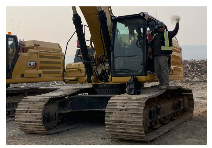
Henry Lopez, from Quesnel, removes the plastic seat cover and is the first operator of this excavator

Our earthworks fleet at the Blackwater Mine now contains approximately 35 individual pieces of equipment, including excavators, backhoe loaders, compactors, grader, telehandlers, and a fuel and lube truck.