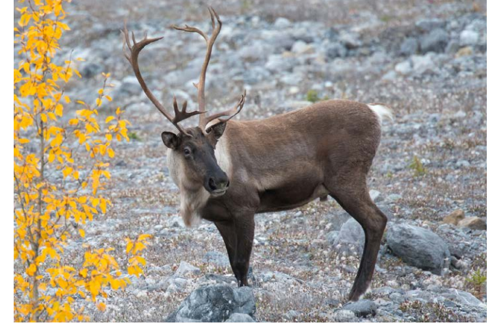
Caribou from the region, not specifically Tweedsmuir Caribou

The development of this plan is the first time a company, the provincial government and First Nations have collaborated to secure mineral tenures in connection with caribou offsetting. We are proud of the work we have done to develop the plan and look forward to continuing to work together to support caribou habitat and restoration in our province.