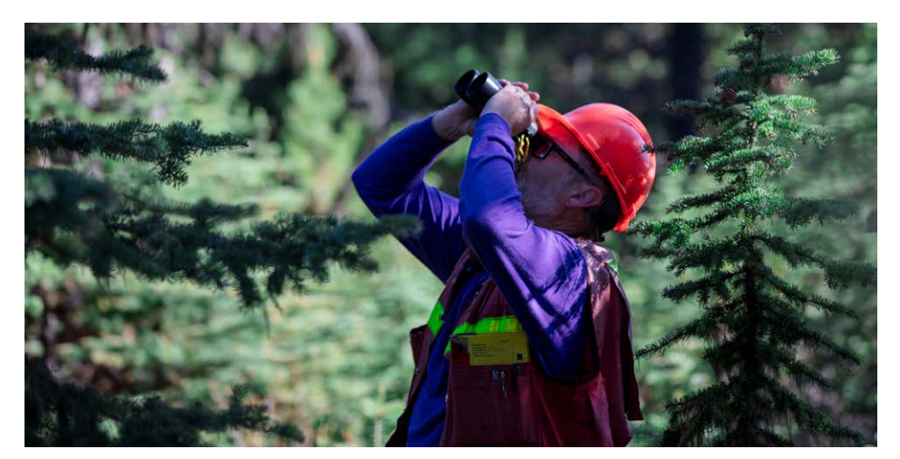
Avison team conducting environmental surveys on site at Blackwater in May 2023

The Blackwater Mine is creating diverse opportunities for local and regional businesses - from supplying materials and equipment to providing repair and maintenance, health, safety, and environmental services. A local natural resources consulting company, Avison Management Services, has been supporting our environmental work at the Blackwater Project for 10 years and has worked in the Vanderhoof area for almost 44 years.